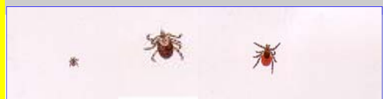
Actual sizes of nymph (left), adult female dog tick (center) and adult female deer tick (right)